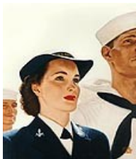
Navy Day 10/27

Go to Move America Forward and support our Active Duty Troops. Donate a package to a Trooper, or a Platoon or a whole bunch. It is easy.