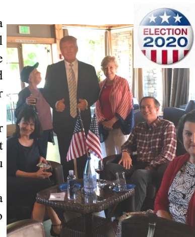
Open, Satellite Club Chair

In the meantime, here is a photo of our Satellite Club to enjoy.