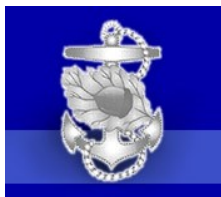
U.S. Navy Nurses Corps 112th Anniversary May 13, 2020

The Veterans Home in Yountville seeks playing cards, puzzles, puzzle books, handkerchiefs, ball caps, and non-perishable snack foods like chips, soup cups, Vienna sausages, candy, and popcorn.