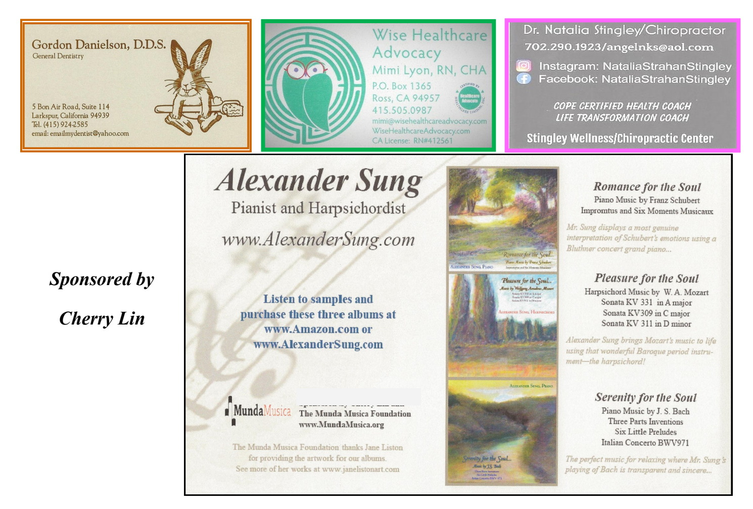
MRWF thanks our sponsors for helping defray the costs of publication and distribution of this newsletter. Copy has been provided by the sponsor and does not constitute endorsement of any product, service or candidate by MRWF, CFRW or this Federated Club.

PLEASE PATRONIZE OUR REPUBLICAN SPONSORS! TELL THEM YOU SAW THEIR AD HERE.