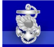
U.S. Navy Nurses Corps 115th Anniversary May 13, 2023

It is easy #1. This is your link to donate: www.moveamericaforward.org