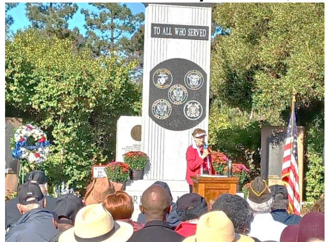
MRWF presenting a wreath to honor our Veterans