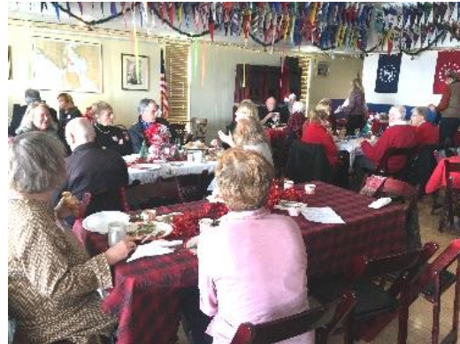
Christmas luncheon 2022 at Loch Lomond Yacht Club